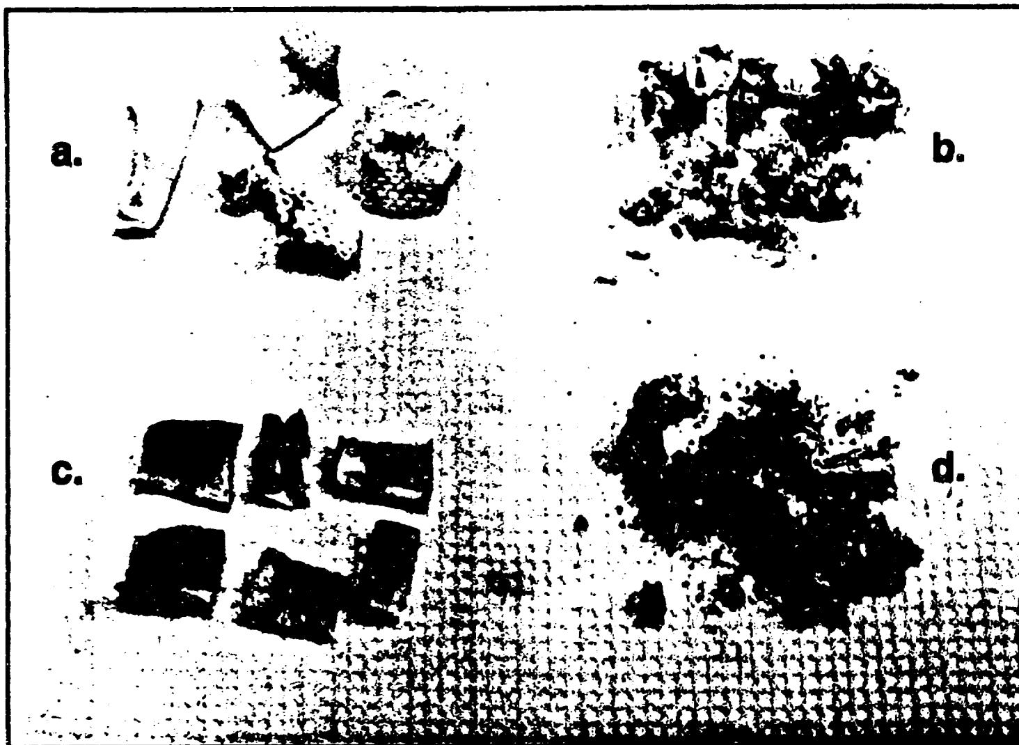
Fig. 1. Radiolytically degraded cellulose. (a) Paper after 24 months exposure at a dose rate of 4 \times 10^4 nCi /g. (b) Paper after 19 months exposure at a dose rate of 400 \times 10^4 nCi /g. (c) Cotton cloth after 24 months exposure at a dose rate of 40 \times 10^4 nCi /g. (d) Cotton cloth after 18 months exposure at a dose rate of 3200 \times 10^4 nCi /g.